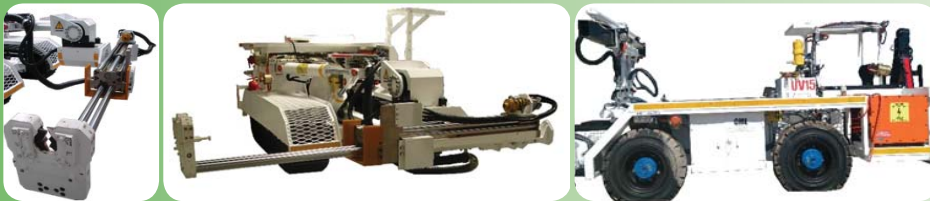
Images (left to right): CMR7-390 EH Crawler Roofbolter; Utility Vehicle (EH Flameproof)