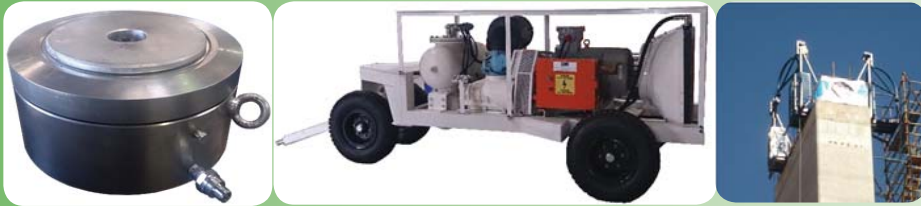
Images (left to right): 400T Pancake Jack; Screw Compressor (Mobile, Flameproof); Special Purpose Lifting Rig Platform (design, manufacture & operation).