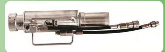
Images (top): Hydraulic Pull Tester with Hand Pump; (bottom): Stressing Jack